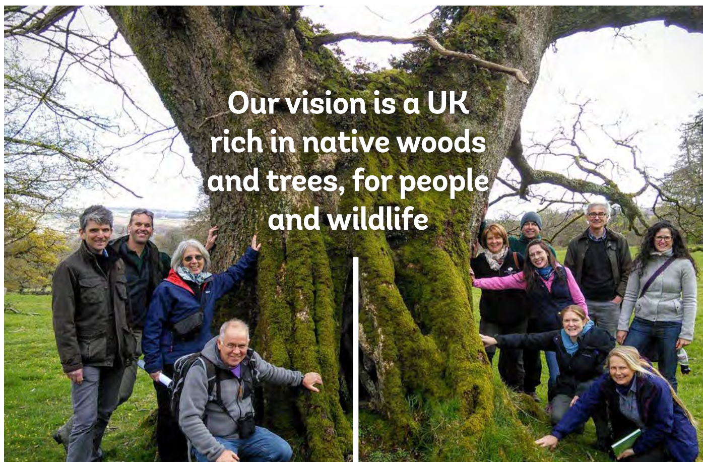
Showing the love for an ancient oak in the Fowey Valley, Cornwall (C. Reid)