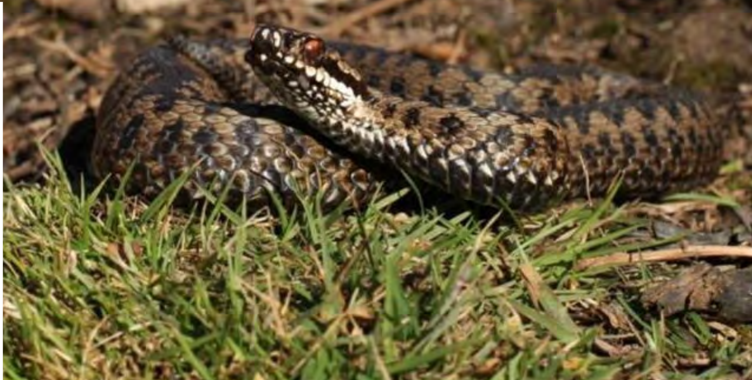
Adder ( Vipera berus ) prefers 'mosaics' of woods and heaths. It has suffered population declines through habitat loss and lack of open ground in woods. (P. Wheeler)