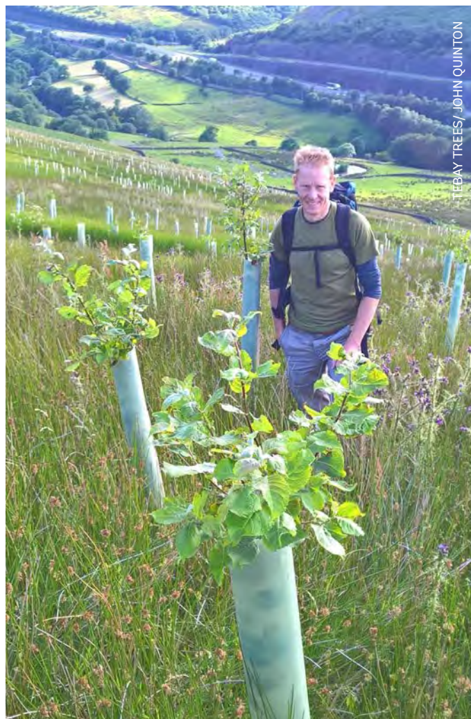
Well-placed tree planting will absorb water and slow peak flows in times of flood, as well as creating better connected wildlife habitats.

More woods and increased tree cover can also help people and their communities to adapt to the impacts of climate change. Well-placed tree planting will absorb water and slow peak flows in times of flood reducing downstream impacts. New urban woods, along with street trees and hedges, will help regulate temperature and absorb pollutants.