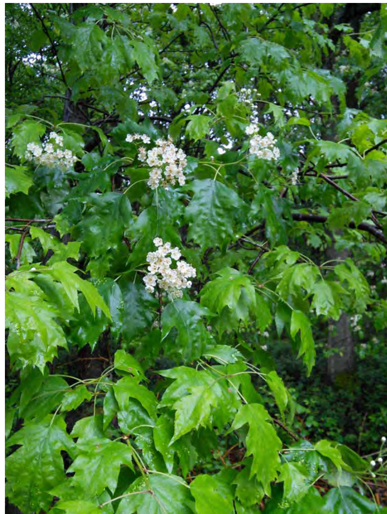
Wild service tree ( Sorbus torminalis ), a native to England and Wales, and indicative of ancient woodland. (C. Reid)

Currently, many woods and landscapes are undergoing accelerated change due to the impacts of tree diseases and pests and the effects of climate change. Successive generations of trees, plants and wildlife can become more fitted to their local conditions through the process of natural selection thus adapting to these pressures. This also allows other woodland species to evolve and adapt in parallel to the trees. Available evidence suggests that adaptation of native trees and woodland is best achieved by allowing our woods to regenerate naturally or by using locally-sourced native tree seed for new generations of planting.