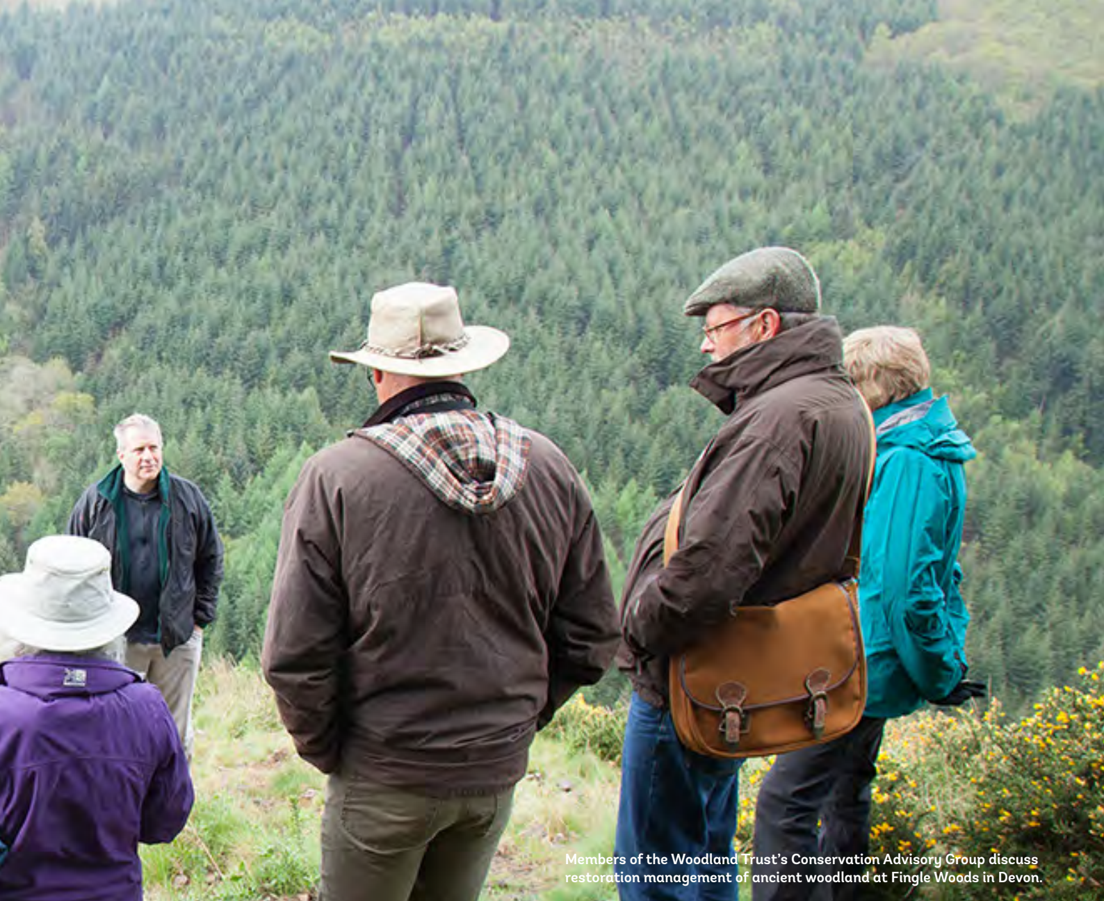
Members of the Woodland Trust's Conservation Advisory Group discuss restoration management of ancient woodland at Fingle Woods in Devon.